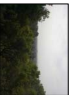
View from Grape Stomp Bench