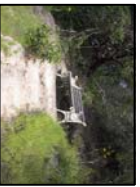
Grape Stomp Bench