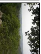
View from Szeptal Point