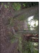
Trail to Benicia's Lake