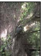
Stream along the Trail