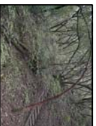
Stumps on the Trail