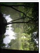
View from Benicia's Lake