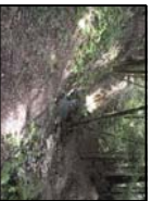
Wooded Area of the Trail